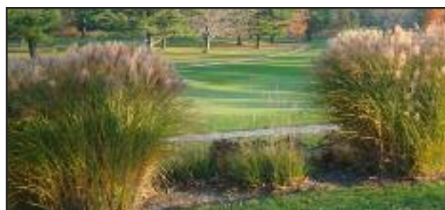
Forest Hills Golf Course