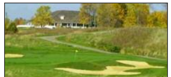
Shaker Run Golf Club