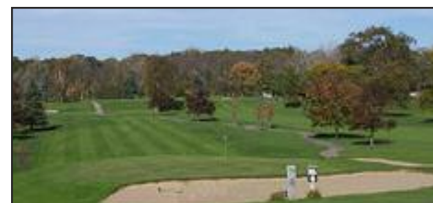
Valleywood Golf Club