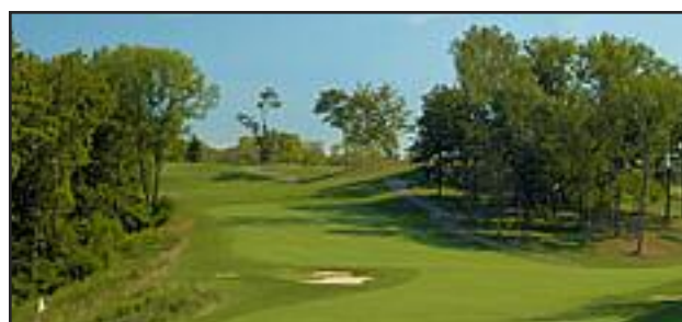
Aston Oaks Golf Club