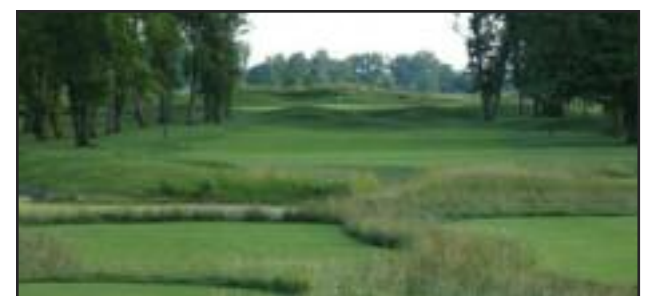
Windy Knoll Golf Club