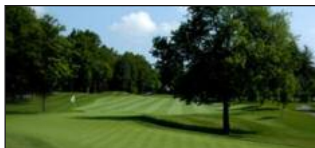
Sycamore Hills Golf Club