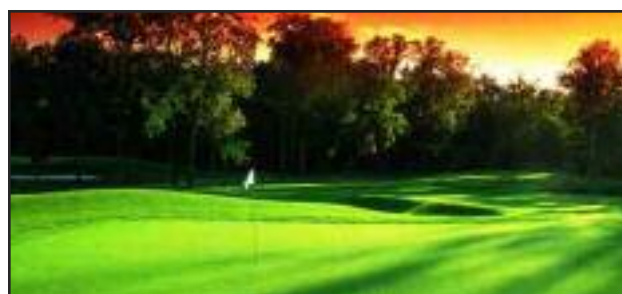
Heatherwoode Golf Club