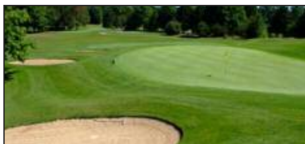
Sanctuary Golf Club