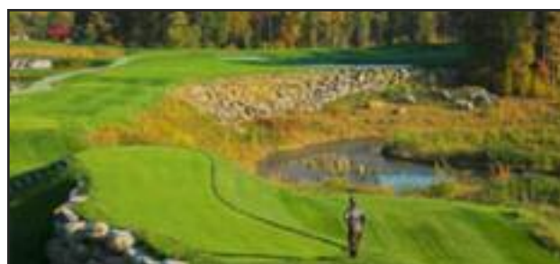
Nemacolin Woodlands Resort