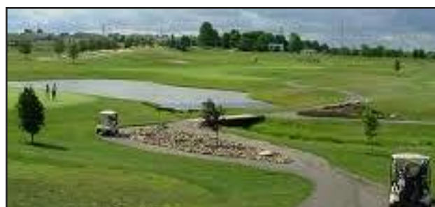
The Legends of Massillon