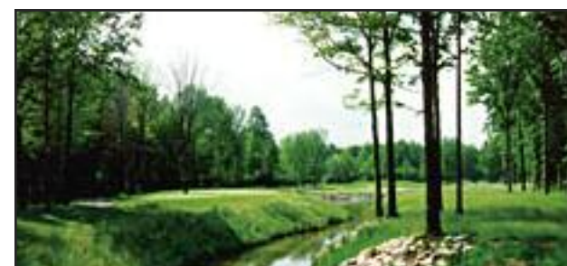
Sweetbriar Golf Club