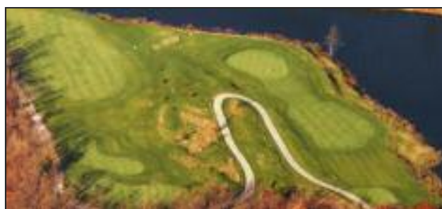
Reserve Run Golf Course