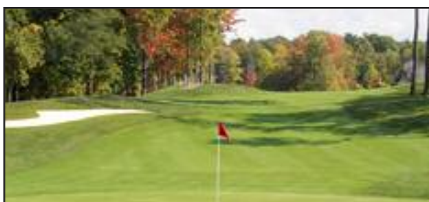
Whispering Woods Golf Club