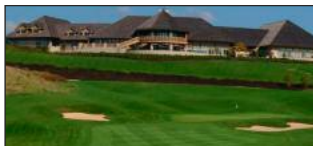
Longaberger Golf Club