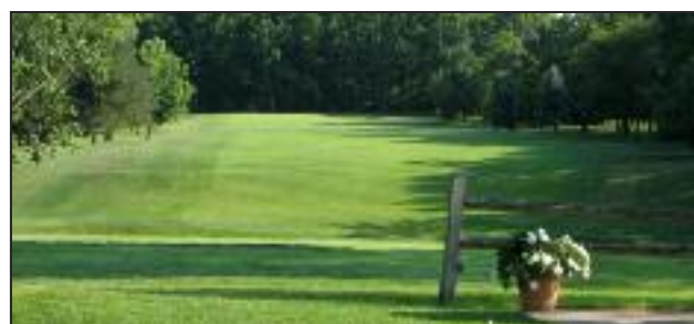
Lincoln Hills Golf Club