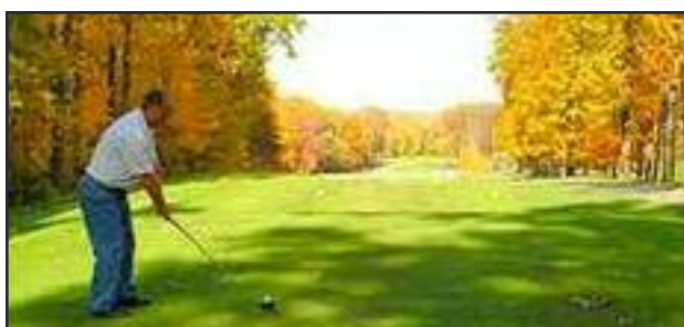
Chenoweth Golf Course