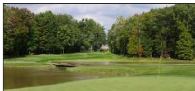
East Golf Club