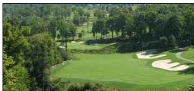
Olde Stonewall Golf Club