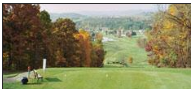
Green Valley Golf Club