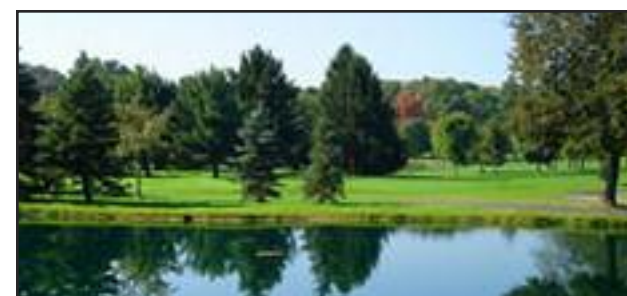
Fox Den Golf Course