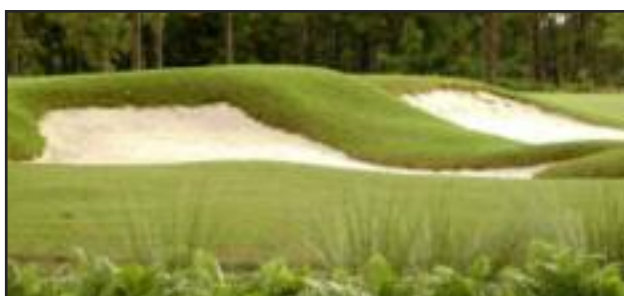
Weatherwax Golf Course