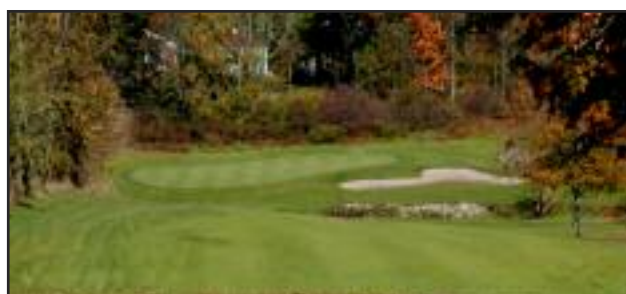
Tanglewood National Golf Club