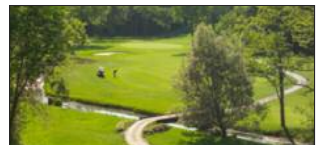
Bunker Hill Golf Course