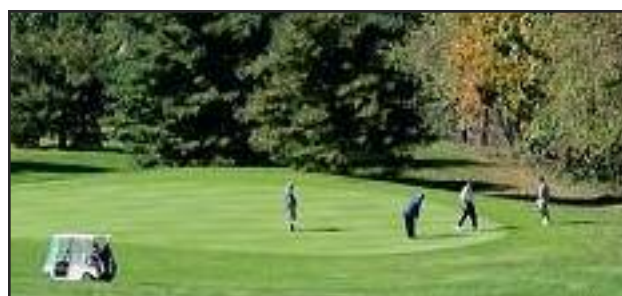
Carroll Meadows Golf Course