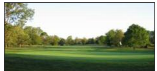
GE Executive Course