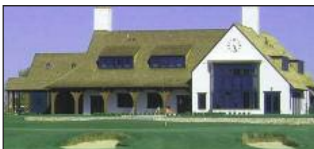
Golf Club of Dublin